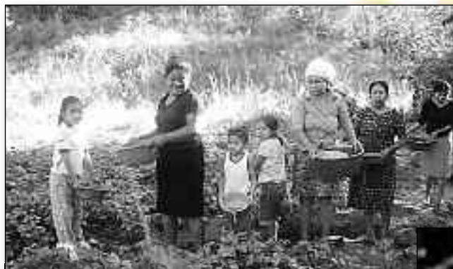
Women's agricultural collective in Honduras

In Canada we raise awareness on global issues and work with Canadian organizations at the local and national levels to bring about positive and lasting change.