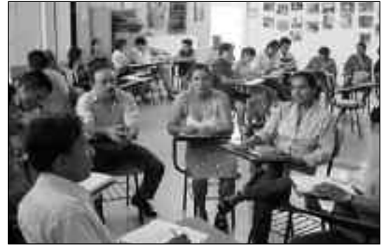
Training for leaders from Latin America and the Caribbean.

Costa Rica Humanitas Association: Humanitas professional staff and volunteers provide a caring environment with integral psychological, medical, legal and spiritual support to over 200 people living with HIV, AIDS and drug dependencies.