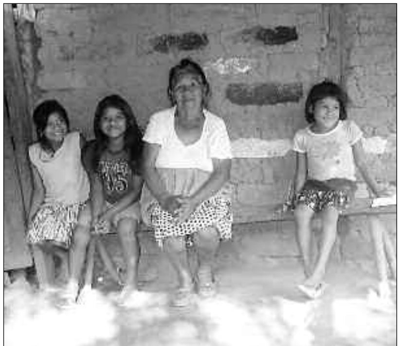
In El Salvador, a grandmother and her grandchildren, people who benefit from Horizons' support for its partners in this country.