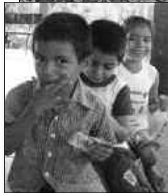
Salvadoran children meet Exposure Tour visitors