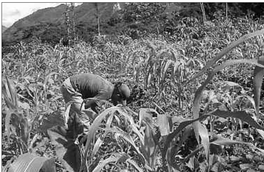
Food Security: Through a Horizons-supported project in Chiapas, Mexico, families now produce bountiful crops for themselves and for a cash income.

Horizons is currently presenting a five-year proposal to the Canadian International Development Agency (CIDA) that includes a two-year bridge fund for its partners in Mexico, Costa Rica and Panama. If the bridge funding is not approved, Horizons will need an extra $120,000 to maintain its programs in these countries. Horizons' Mesoamerican program has received generous support from CIDA for many years.