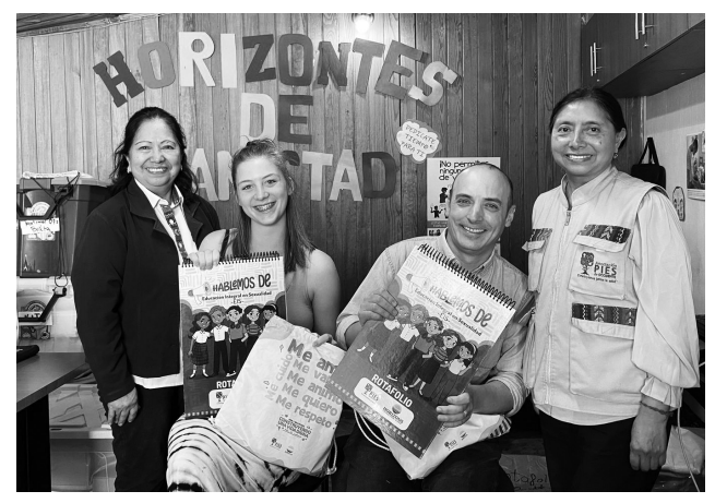
Horizons staff were warmly welcomed by our partner PIES. They showed us all the educational resources on sexual and reproductive health they have created as part of the Safe Haven project.

I ask you to continue to support these projects with a gift of $50, $75 or $100, or even a smaller amount. Your donations make a huge difference to the lives of people in the South.