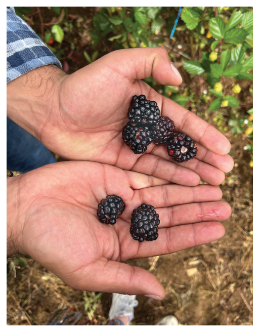
A crop of blackberries harvested in the community of San Andreas in Chiapas, Mexico.