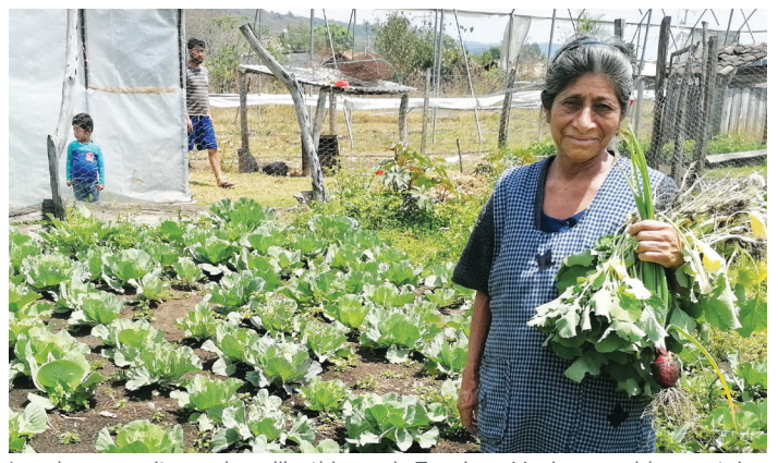
Local community gardens, like this one in Teopisca, Mexico, provide a sustainable source of food and food security for small scale farming families.