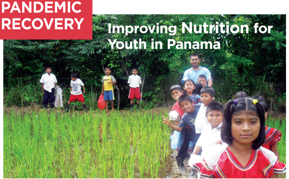
Children and youth in Ngäbe-Buglé Indigenous communities are learning about nutrition and traditional food preparation techniques.