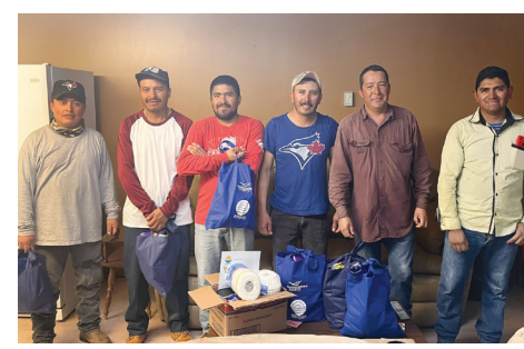
Welcome kits, filled with food and basic necessities, help alleviate financial stress upon arrival.

1. Financial insecurity. We are providing welcome kits to every migrant worker, filled with basic necessities like food and personal hygiene items, as well as information in both Spanish and English on health, workplace safety, and emergency contacts. The kits help alleviate financial stress upon arrival, and let migrant workers know they are in a community that welcomes and supports them.