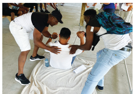
At monthly workshops, migrant workers learn about health and safety and emergency care.

2. Isolation. We are expanding opportunities for migrants to get to know each other and participate in fun and informative activities away from work. This summer, we headed to Toronto for a Blue Jays baseball game, tickets courtesy of long-time supporter Steelworkers Humanity Fund. The trip was a big hit with the migrant workers and very appreciated.