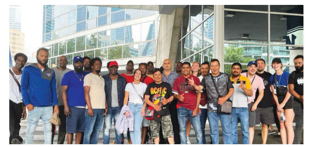
A trip to Toronto to see the Blue Jays play was a big hit with the migrant workers.

Horizons of Friendship's Migrant Worker Outreach Program is teaming up with new partners to expand its supports for Northumberland County's migrant workers.